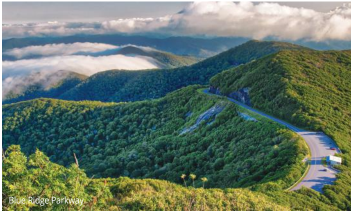
Blue Ridge Parkway

Dive into Music City's dynamic atmosphere on a panoramic city tour , tracing the footsteps of country music legends like Dolly Parton. Next, journey to Belle Meade Plantation for a mouthwatering lunch and local wine tasting. Afterward, delve into the captivating Old South with a private tour of the plantation and grounds. In the afternoon, explore the vast Country Music Hall of Fame's 2 million-item collection before browsing unique souvenirs in the bustling gift shop. Tonight, unwind at the hotel's rooftop pool or savor the flavors of local barbecue on your own. You'll never forget the lively spirit of Nashville. B L