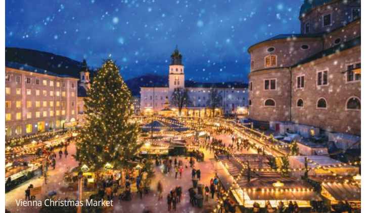
Vienna Christmas Market

Then, continue your journey to Oberammergau , a picture-perfect Bavarian village where a dinner of regional cuisine awaits . Spend the afternoon exploring the village at your own pace, discovering the local shops, or simply soaking in the serene ambiance. B D