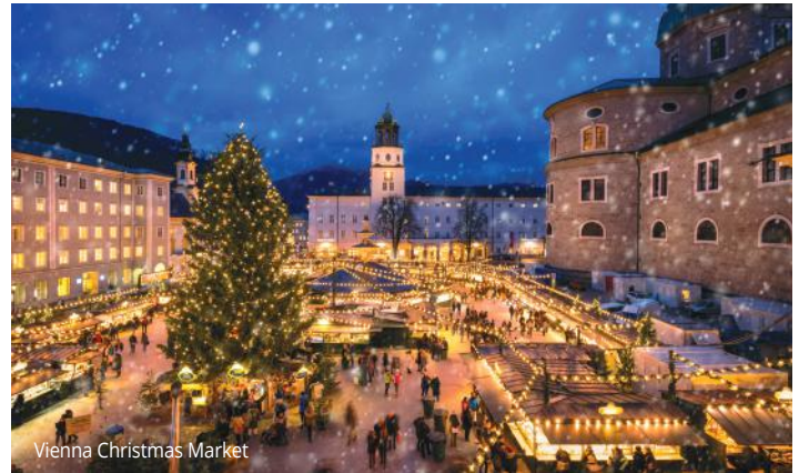
Vienna Christmas Market

Then, continue your journey to Oberammergau , a picture-perfect Bavarian village where a dinner of regional cuisine awaits . Spend the afternoon exploring the village at your own pace, discovering the local shops, or simply soaking in the serene ambiance. B D